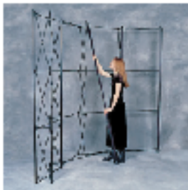
Next attach the 3-part magnet rail (channel bar) to the frame