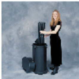
ELLIPSE pop-up displays setup in minutes