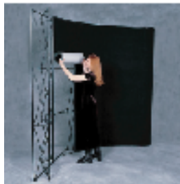
Hang the panels at the top of the frame and guide them down the center of the channel bars