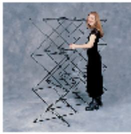
Simply expand the frame and snap into place