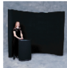
After booth is setup, you can attach graphics with velcro to enhance your display or accessories like shelves.